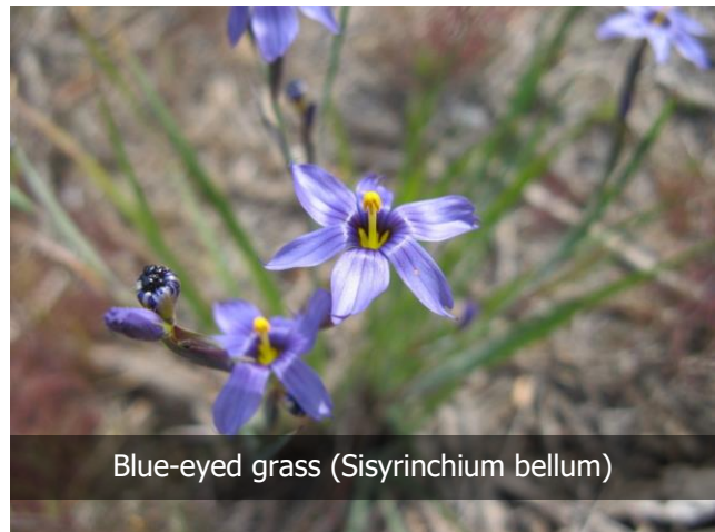
Blue-eyed grass ( Sisyrinchium bellum )

The first hints of spring color are popping at San Elijo Lagoon. Look for Blue-eyed grass ( Sisyrinchium bellum ) next time you're on the trails. Ironically it is not a grass—it's an iris—and the only native iris in our 1,000-acre ecological reserve. These blooms and many exciting wildlife discoveries are yours to enjoy when you join San Elijo Lagoon Conservancy naturalists for Lagoon Discovery Tours. Hosted on first and last Saturdays, these complimentary tours provide a refreshing opportunity to learn what's always changing, season by season, and hourly with the tides.